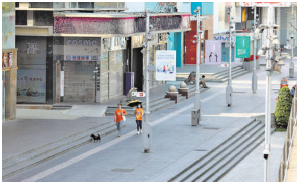
Tied down: China's tech hub Shenzhen, home to 17.5 million people, has been locked down due to rising infections.

Jilin is a manufacturing hub particularly for automobile companies, and carmakers Toyota and Volkswagen