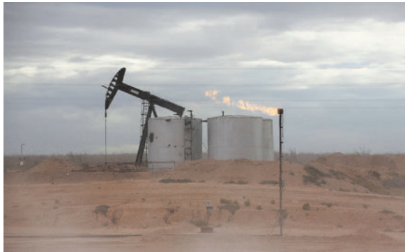
Eyes on oil: Crude price movements are likely to dominate the inflation trend in the coming months, says FinMin. ■ REUTERS

The impact of recent developments, including the Russia-Ukraine crisis, on India’s growth, inflation, current account and fiscal deficits would depend on how long commodity prices persisted at elevated levels, the ministry noted. India’s robust growth estimates for 2022-23, from agencies such as Fitch Ratings (10.3%) and Moody’s (8.4%), would face a