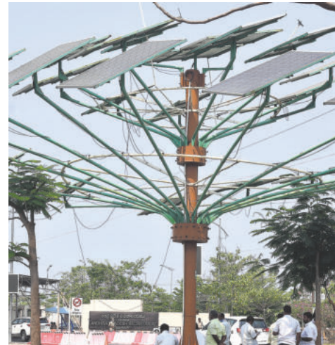
Sunshine state: Visitors of the Andhra Pradesh Assembly take shelter under a 'solar tree' set up for solar power generation in Velagapudi of Guntur district. FILE PHOTO

India has grown from strength to strength in overcoming barriers to achieve the 50 GW milestone in Feb 2022. The destination is clear, and the journey is progressing. As India attempts to deal with some of the shortcomings identified above, India's solar story will continue to provide important